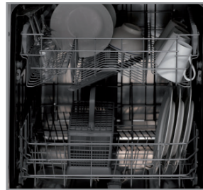
Large plate capacity 31cm

Easy adjustable top basket even when fully laden