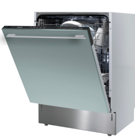
OPEN door view