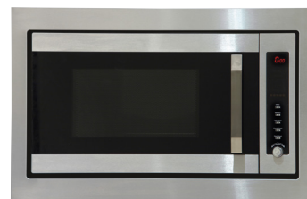
IM30SE3 pictured with IMI30ST3 trim kit